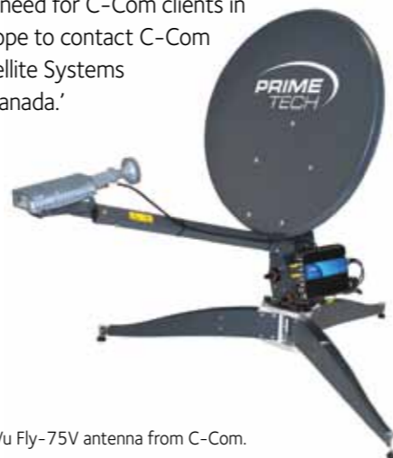
iNetVu Fly-75V antenna from C-Com.