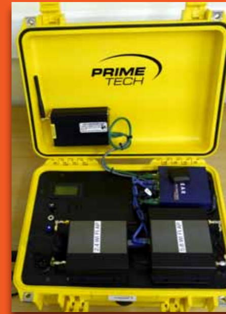
Primetech MultiNet Comms Incident Ground Extender Node, featuring 2.4 and 5.8 MHz WiFi communications linked by a COFDM mesh network.

These feature 2.4 and 5.8 MHz WiFi communications linked by a COFDM mesh network. This means they are capable of receiving and transmitting