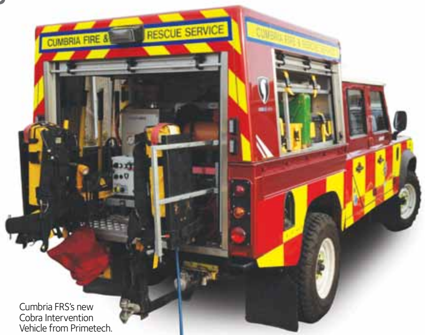
Cumbria FRS's new Cobra Intervention Vehicle from Primetech.