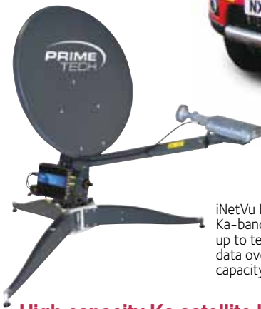
iNetVu Fly-75V antenna. Ka-band satellites transmit up to ten times as much data over the same satellite capacity as Ku-band.